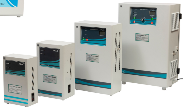
Model "A" Series