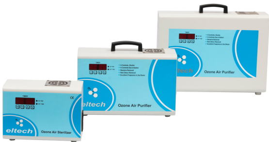
Model "AOZ" Series