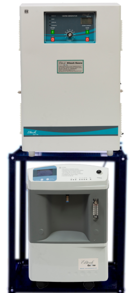
Model "O" Series