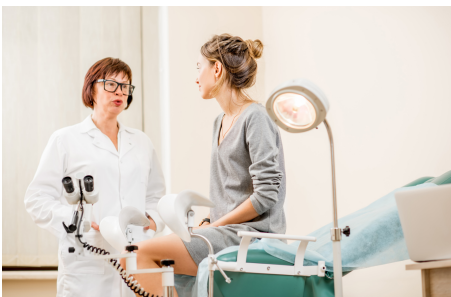
Ozone for cancer Treatment