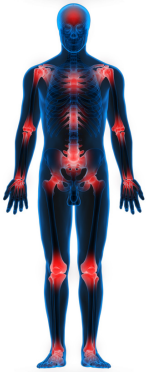
Ozone Joint Injection