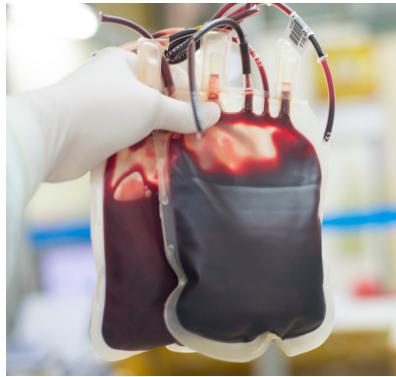
Ozone Blood Treatment