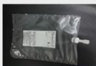
PVDF Ozone bag