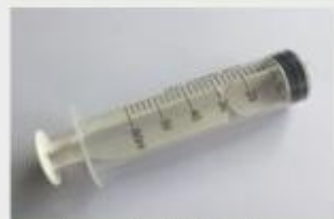
Luer lock Syringe