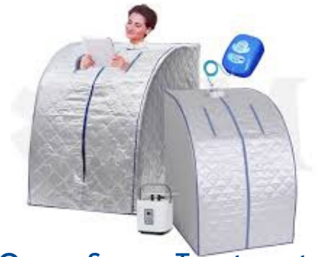
Ozone Sauna Treatment

Medical ozone is Tried, Tested and Trusted Source for Ozone therapy which is in form of alternative to medicine that helps to increase the amount of oxygen in the body through the introduction of ozone.