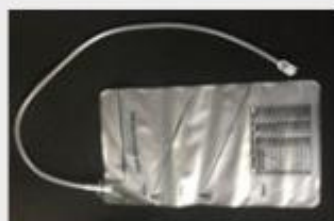
O3 insufflation bag