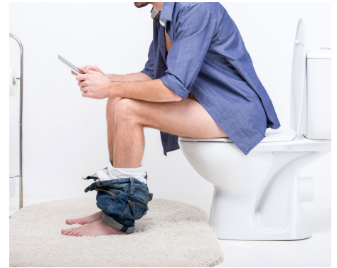
Ozone Rectal Insufflation