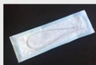
Luer lock Catheter