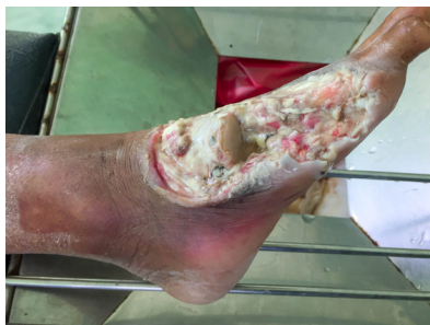
Ozone for wound healing